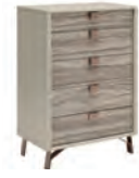
5/DRW. CHEST KJJP115 With 5 drawers

inch W 27" D 17" H 27" cm L 69 P 43,3 H 68,7 Crts 1 kg 37 m 3 0,23