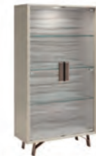
2/D CURIO CABINET US LIGHT KIT PJJJP0681 UK LIGHT KIT PJJJP0682 EU LIGHT KIT PJJJP0680 With 2 glass doors

inch W 63"/104" D 37" H 30" cm L 160/264 P 95 H 76,3 Crts 3 kg 104 m 3 0,54