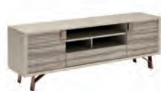
TV BASE KJJP630

inch W 44" D 1" H 41" cm L 111,8 P 2,6 H 103,9 Crts 1 kg 27 m 3 0,09