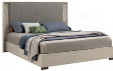
Q.S./UK 5" BED PJJ0150 (UK FIRE RETARDANT) PJJ0150I

inch W 34" D 20" H 50" cm L 84,5 P 51,3 H 126,7 Crts 1 kg 83 m 3 0,62