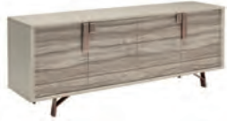
4/D BUFFET KJJP610 With 4 doors

inch W 82" D 20" H 31" cm L 208,7 P 51,3 H 79,5 Crts 1 kg 107 m 3 0,9