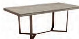
EXTEN. TABLE W250 PJJJP0618 With 2 leaves w 20 1/2" cm 52

inch W 82" D 20" H 31" cm L 208,7 P 51,3 H 79,5 Crts 3 kg 98 m 3 0,97