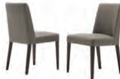
2 CHAIRS KJJP620 2 CHAIRS (UK FIRE RETARDANT) KJJP620I

With 2 doors and open unit inch W 70" D 17" H 24" cm L 178,4 P 42 H 61,7 Crts 1 kg 67 m 3 0,46