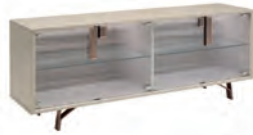
4/D BUFFET GLASS DOORS US LIGHT KIT PJJJP0611 UK LIGHT KIT PJJJP0612 EU LIGHT KIT PJJJP0613 With 4 glass doors

inch W 43" D 20" H 31" cm L 108 P 51,3 H 79,5 Crts 1 kg 60 m 3 0,47