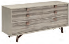
DRESSER KJJP120 With 6 drawers

inch W 68" D 20" H 32" cm L 173 P 51,3 H 80,2 Crts 1 kg 94 m 3 0,74